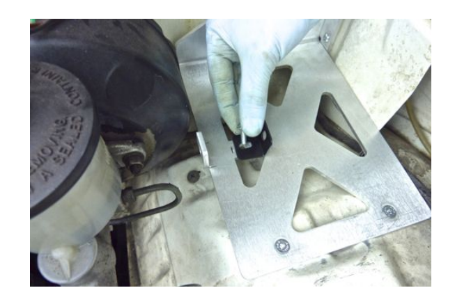
Step 10 Install the supplied button head allen screw from the top and start the nut on the bottom. Do NOT tighten the nut yet.