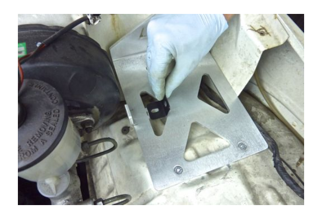
Step 9 Position the bottom bracket as shown.