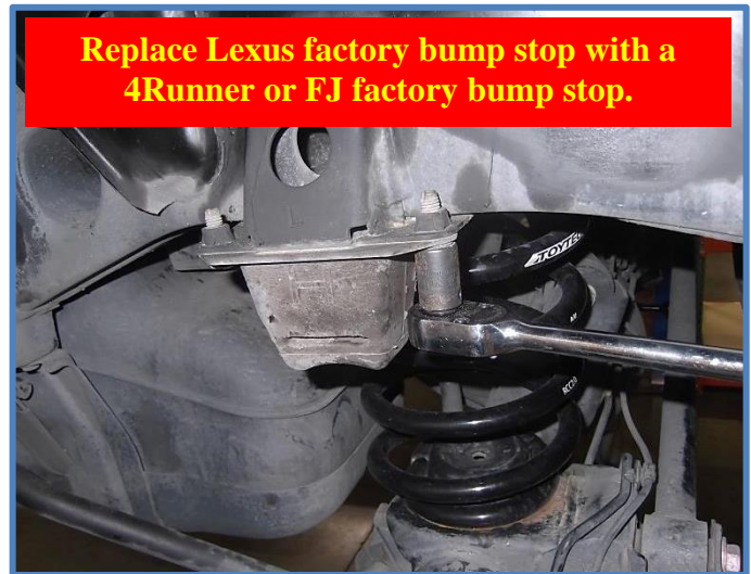
Replace Lexus factory bump stop with a 4Runner or FJ factory bump stop.