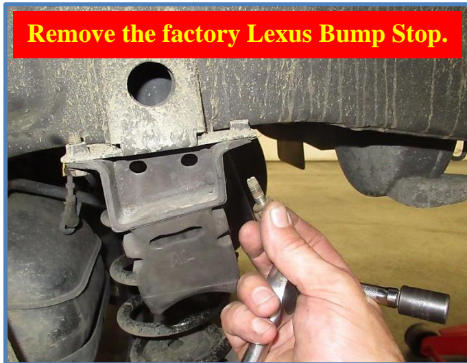
Remove the factory Lexus Bump Stop.