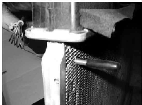
then replace the insulator cap.