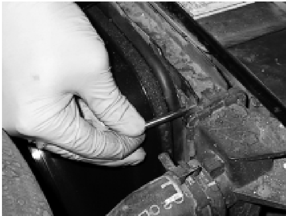
Install temp. probe near inlet hose...

Step 9: Insert the temperature probe into the radiator fins: Locate the inlet hose from the engine to the radiator. Remove the black insulator cap and insert the temp. probe through the radiator fins near the inlet hose. Reinstall the black insulator cap.