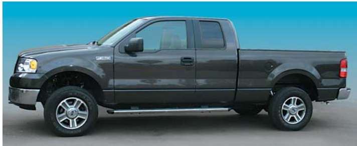
After 5100 Series Leveling Shocks Installed